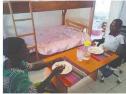
A family at the Family Center enjoying a meal