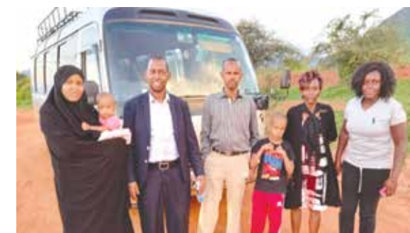
Patients and family members travelled to Tanzania