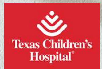
Texas Children's Hospital Cardiac Alliance