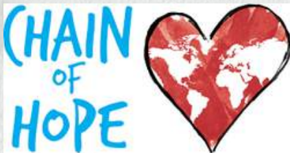
Chain of Hope